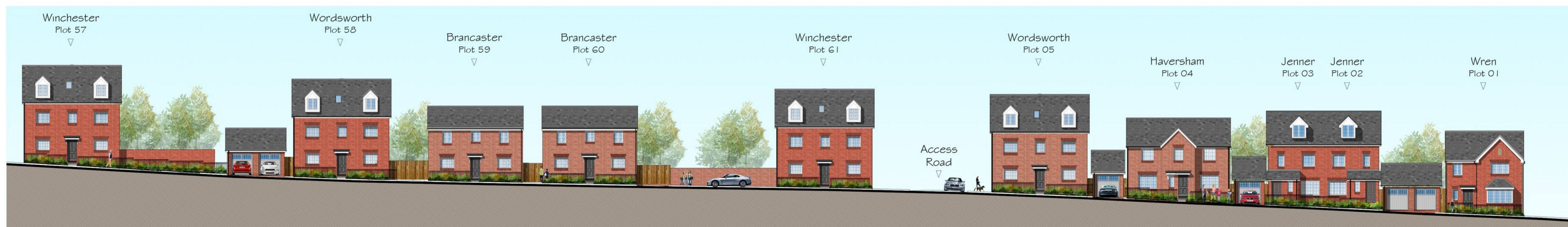
Street Scene C-C