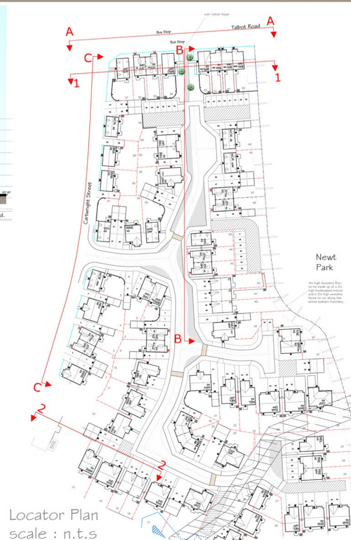
Locator Plan scale : n.t.s