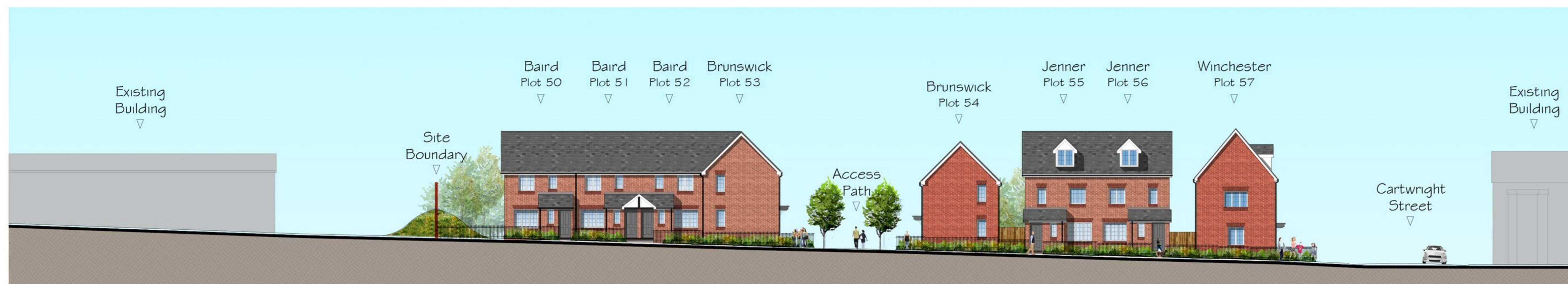
Street Scene A-A

This document and its associated intellectual assets remain the property of Baldwin Design Consultancy Ltd. and no element of such is to be used beyond the contracted usage.