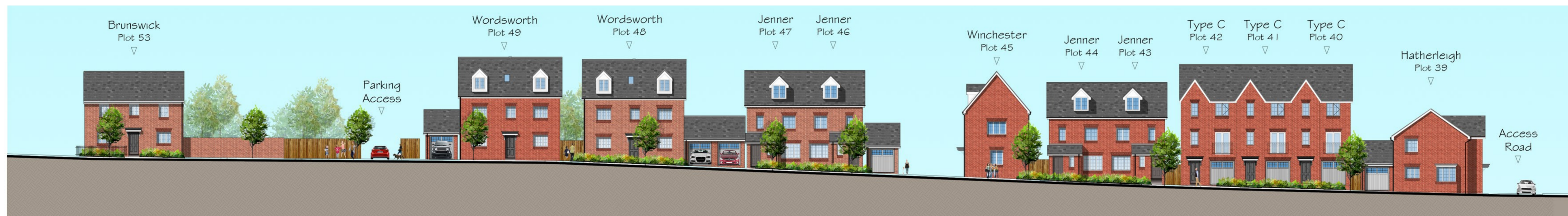
Street Scene B-B